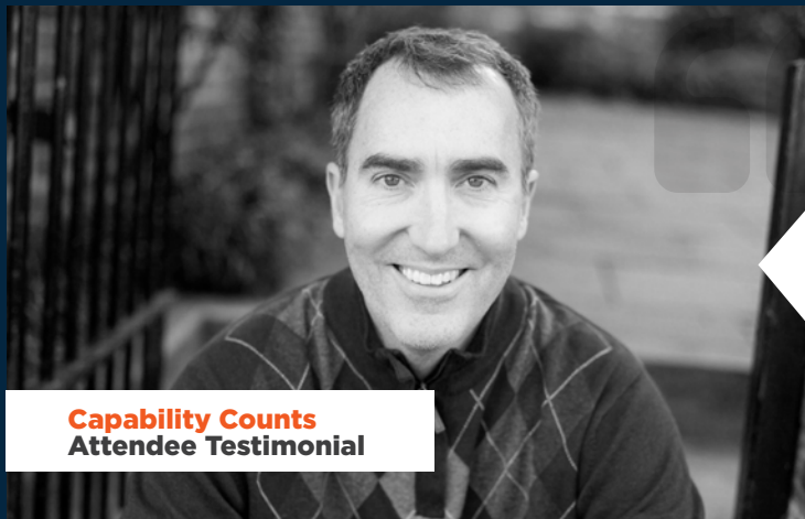
Capability Counts Attendee Testimonial

Sponsors and Exhibitors at Capability Counts have the unique opportunity to position themselves as market leaders, meet with potential customers, network with industry thought leaders, and gain competitive advantage and brand exposure at this premier two-day event.